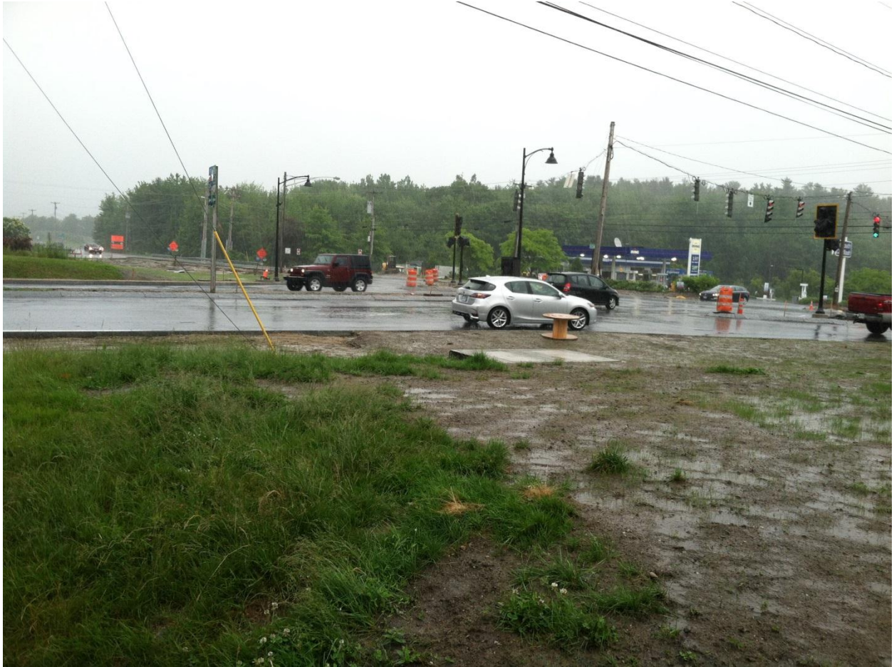
This is the Bucknam Road intersection. You can see that new traffic and pedestrian signals have been installed.