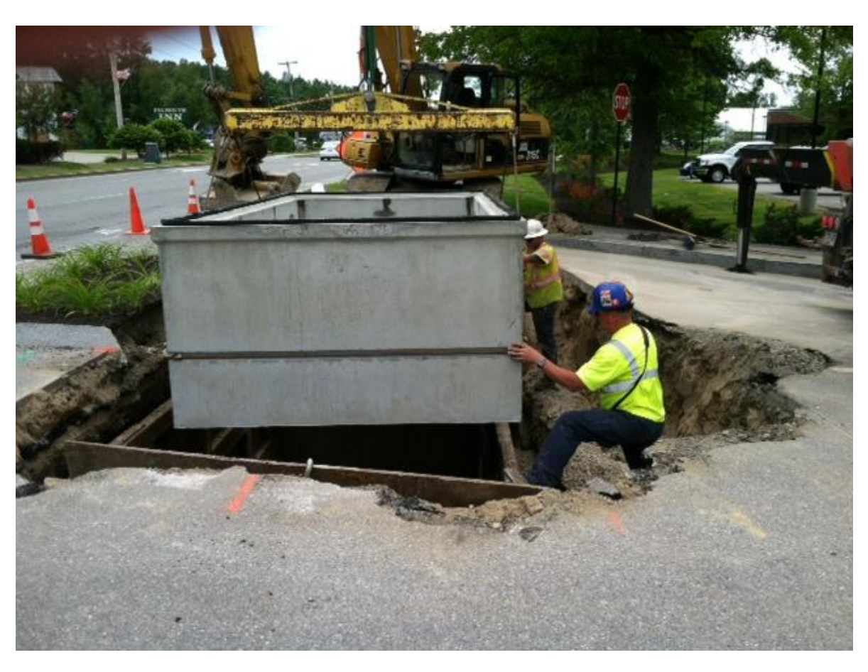
The crew carefully aligns the structure over the pit and lowers it into place.