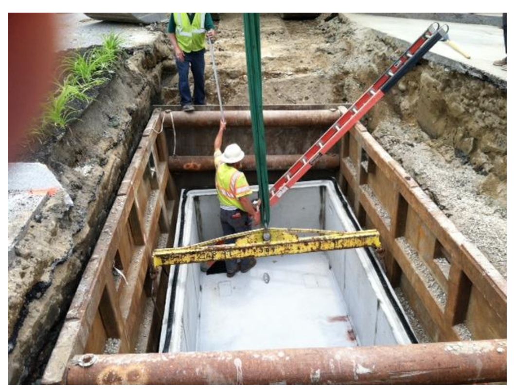
The foreman descends into the bottom half and carefully checks for level. It is perfect, thanks to careful preparation before the hoist. The black strip (gasket) on top of the structure is installed to seal the top section to the bottom.