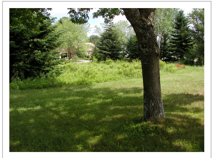
Low Impact Yard: No pesticides, fertilizer or watering are used to maintain this yard in Topsham. The "old field" is maintained simply by clipping unwanted trees and shrubs once a year. The lawn consists mainly of native Maine grasses that are well adapted to this dry site.

The Falmouth Conservation Commission has developed recommendations to help homeowners obtain more information and assistance in implementing a yardscaping program on their property. There are many sources of help and no shortage of ideas on what to do, but you may have to do some digging to get the answers you are looking for. We hope that the recommendations contained in this fact sheet will get you started on the right track quickly.