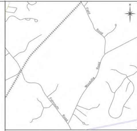
VICINITY MAP No Scale