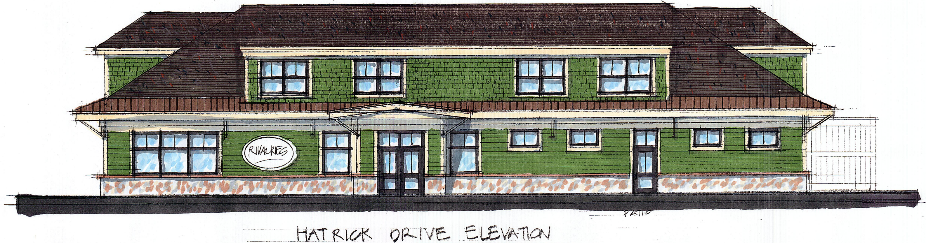
HATRICK DRIVE ELEVATION