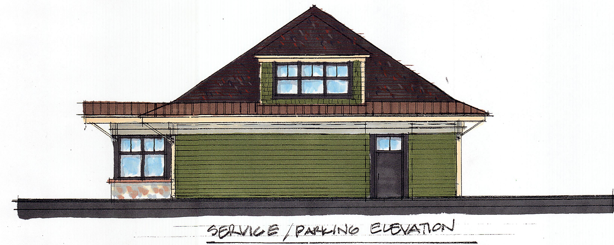
SERVICE / PARKING ELEVATION

COPYRIGHT REPRODUCTION OR USE OF THIS DOCUMENT WITHOUT WRITTEN PERMISSION FROM GRANT HAYS ASSOCIATES IS PROHIBITED.