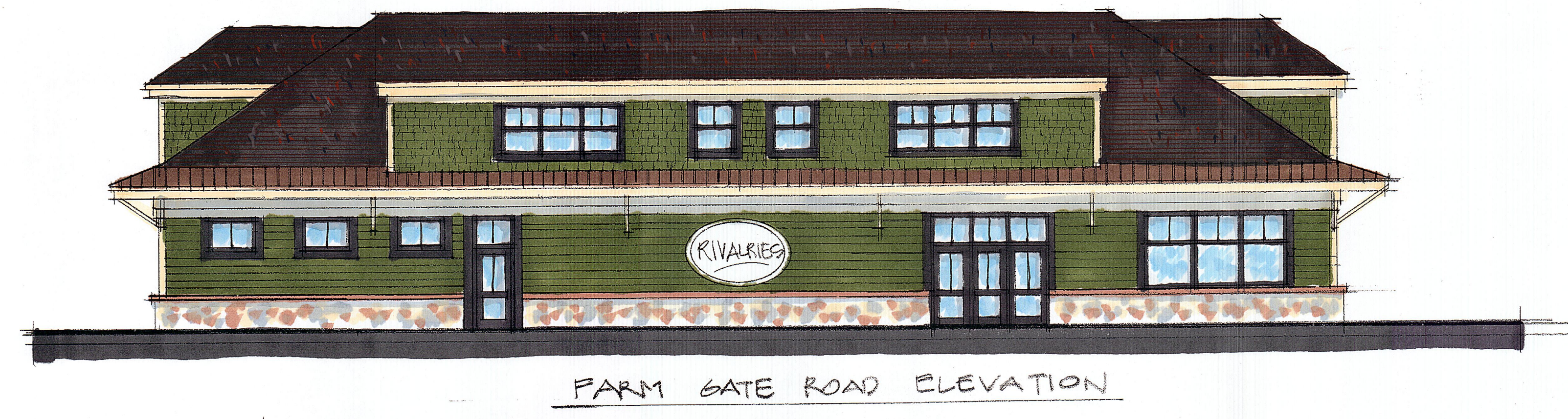
FARM GATE ROAD ELEVATION