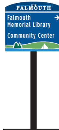
Small vehicular directional sign.

Signs with three or more destinations are proposed to be large directional. Signs with one or two destinations are proposed to be small.