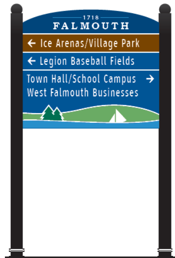
Large vehicular directional sign.