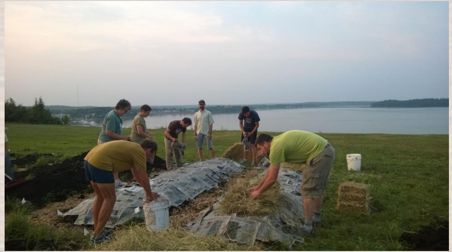
Volunteers using permaculture techniques to establish community garden beds on Portland's Eastern Prom.