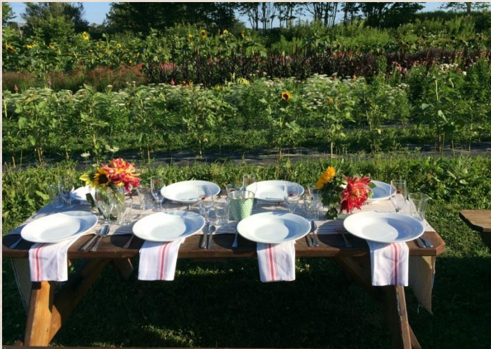
A table set for a Twilight Dinner at the William H. Jordan Farm in Cape Elizabeth, ME.