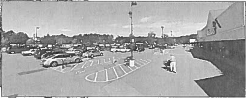
Parking Area - Satellite View and Street Level View

Shaw's #4651 251 US Highway 1 Falmouth, ME 04105