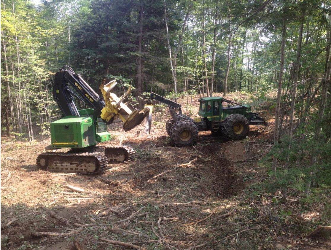
*Feller buncher and grapple skidder used in whole tree harvesting.

I recommend the yard be located in the hay field on lot 88. Getting trucks to the north end of the field may be difficult during icy road conditions; therefore tire chains on trucks may need to be used. Also, inevitably there will be brush and wood chips that need to be pushed off of the yard at the end of the operation. I like to locate the yard near a slight slope so material can be pushed out of the field and over a bank. This makes the finished job aesthetically pleasing.