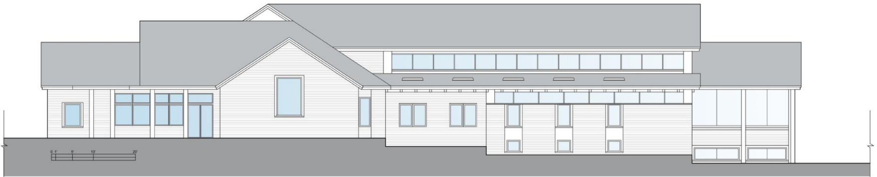
FROM LUNT ROAD