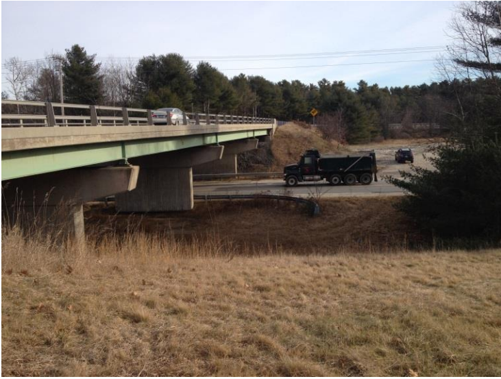
Figure 2: Bridge to be removed looking southeast