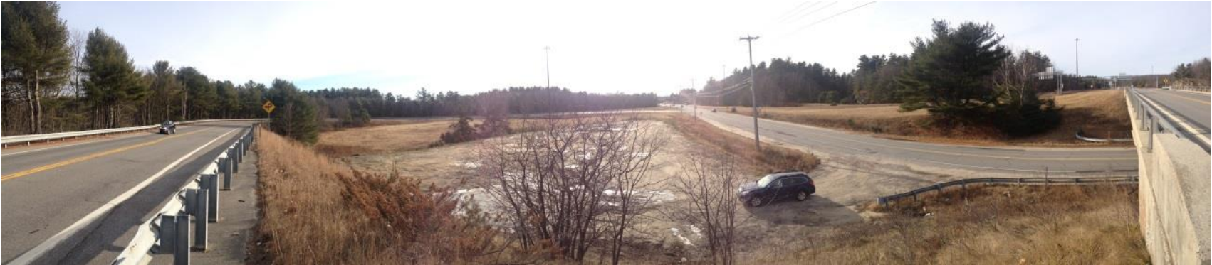
Figure 4: Development site looking south