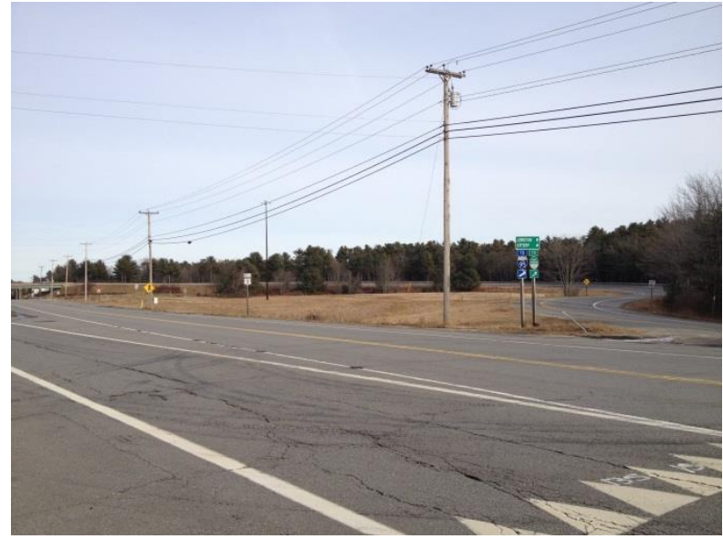
Figure 3: Development site looking east-northeast