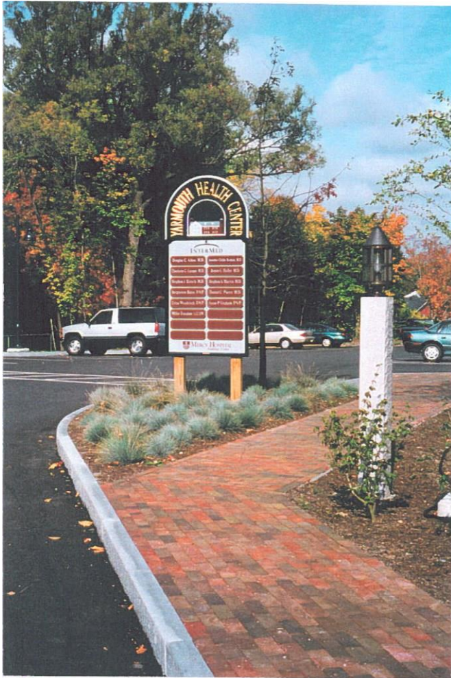
Directory of health care providers, in a distinctive format.