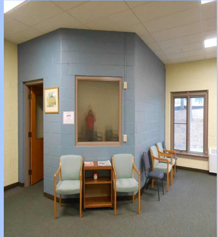
AREA FOR KITCHEN