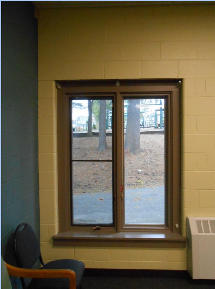
Window to convert to back door