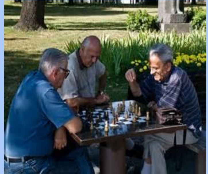
Outdoor tables & benches