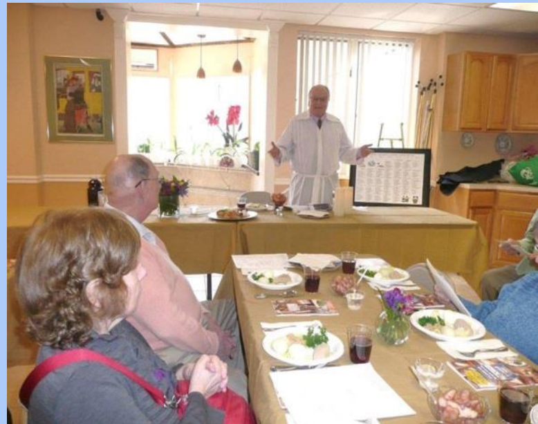
Lunch and Learn Programs