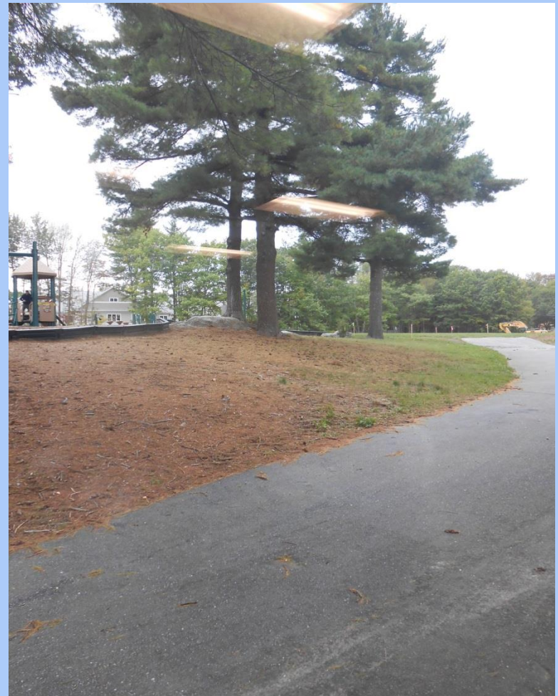
Path to Park from back door