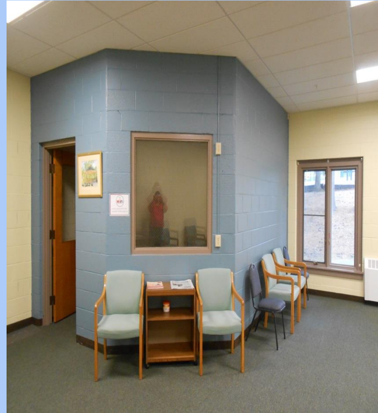
AREA FOR KITCHEN