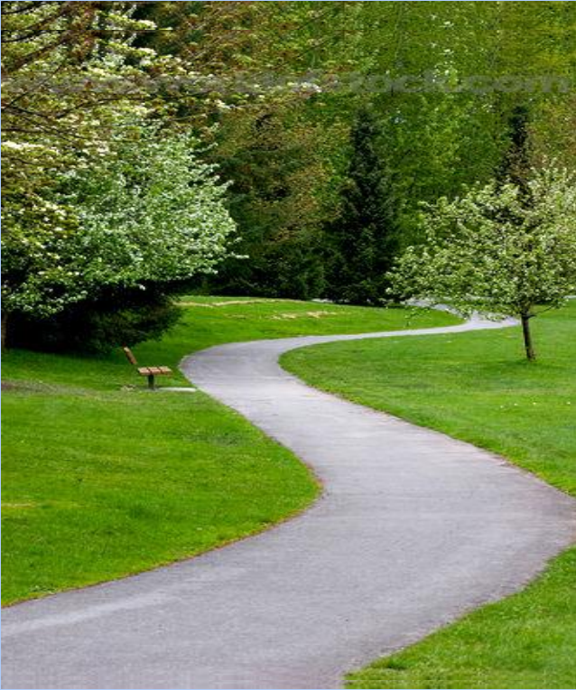
Paved walkway & shade trees