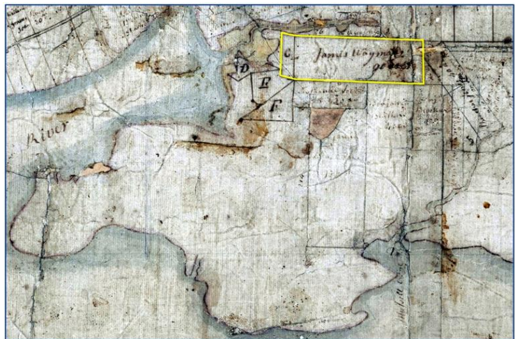
Falmouth Foreside with Wyman's tract in yellow (1732) 8

The next chapter in the story of Tidewater Farm began in 1729 when the Town of Falmouth granted "90 acres on Squitteryussett Creek in New Casco" (Falmouth) to James Wyman. The land was on the east side of the creek. 7