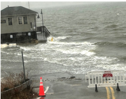
The impact of recent storms on Town Landing. From top to bottom: December 2022, January 2024, March 2024.