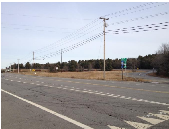
Figure 4: Development site looking east-northeast