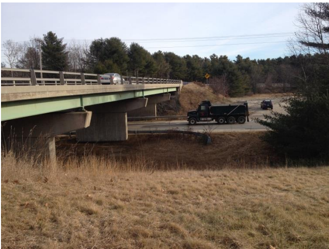
Figure 7: Bridge to be removed looking southeast