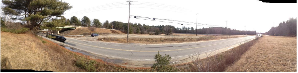
Figure 8: Route 1 with development site in rear looking southeast