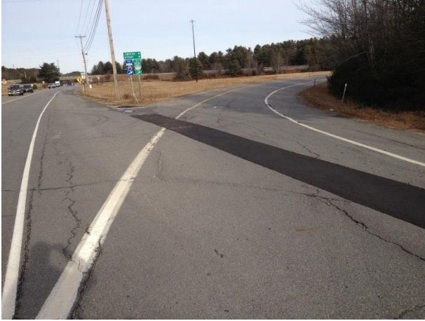
Figure 2: Route 1 and NB on-ramp looking northeast