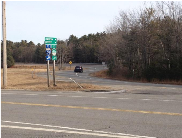
Figure 3: NB on-ramp looking east