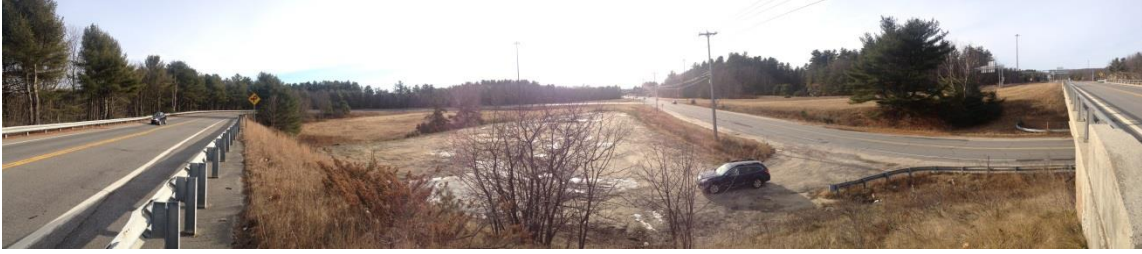
Figure 5: Development site looking south