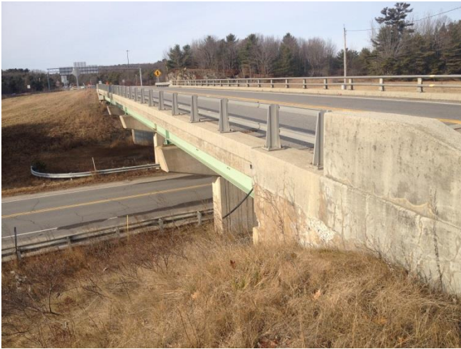
Figure 6: Bridge to be removed looking northwest