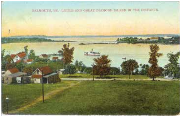
1909 view from Falmouth shore with steamboat.

During the 1800s, Falmouth sent soldiers to battle in three major wars including the War of 1812 and the Spanish American War. When Confederate forces fired on Fort Sumter in 1861, Maine's governor called for the formation of ten regiments of volunteer infantry. Of the 73,000 Mainers who served in the Union Army, Falmouth sent at least 102 men to battle during the Civil War. Soldiers from Falmouth saw heavy fighting in units that sustained some of the highest percentage of casualties of all federal regiments.