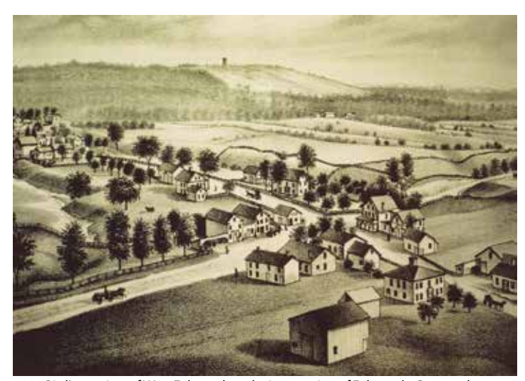
1880 Bird's eye view of West Falmouth at the intersection of Falmouth, Gray, and Mountain Roads.

Falmouth's close connections to Portland determined its pattern of growth. Rather than settling around a village center, residents established themselves throughout Falmouth along various roadways leading out of Portland and usually within close range of a water source and mill site. These neighborhoods boasted their own churches, schools, stores, and social clubs. The unique character of these "hamlets" remains a distinct feature of Falmouth even today.