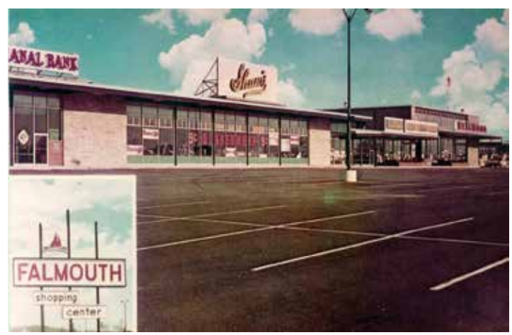
1970 Falmouth Town Shopping Center.

In 1963, Falmouth's first Town Plan noted that the town's proximity to Portland would ensure steady residential and commercial growth for the foreseeable future. Most residents at this time found their employment and family incomes through opportunities elsewhere in the region, despite what the 1963 Plan identified as economic opportunities of "major magnitude" for employment within Falmouth. The plan proposed continued commercial development, like the new Falmouth Shopping Center on Route One and new commercial development at the intersection of Gray Road, the Falmouth Spur, and the Maine Turnpike. Additionally the plan advised industrial development both on Gray Road and on Route One north of the Spur. The plan also noted that aside from school sites, Falmouth had almost a total lack of public land, and recommended the acquisition of land for future schools, recreational and conservation areas, and municipal uses. At about the same time, community members, recognizing the need to preserve Falmouth's history, established the Falmouth Historical Society in 1966.