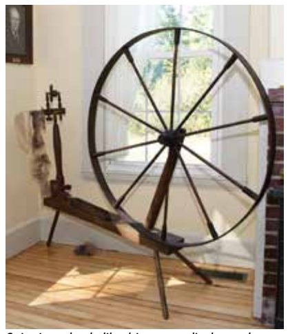
Spinning wheels, like this one on display at the Falmouth Historical Society, were a fixture in most New England homes.

The wooded lands of early Falmouth proved crucial to its early economy. Wood was harvested for building materials and fuel. Many of Falmouth's earliest settlers established lumber mills along the Presumpscot and Piscataqua Rivers, and at Mussel Cove. In these early days, Maine's tall white pines were its most precious commodity. Falmouth was a crucial supplier of masts for the British navy, bringing an economic boom to the settlements of Casco Bay. A large number of Falmouth residents worked in the mast trade. Some of the earliest ships built in Falmouth were mast ships, constructed to carry huge cargoes of masts to England. Today's Falmouth boasted several shipyards, along the Presumpscot River, Skitterygusset Creek, and near Lady Cove close to Waite's Landing.