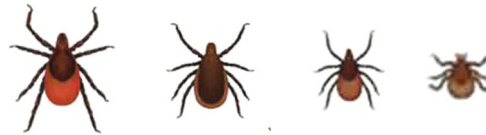
Adult Female Adult Male Nymph Larva