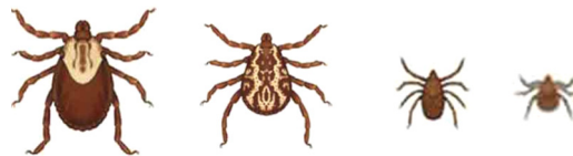
Adult Female Adult Male Nymph Larva