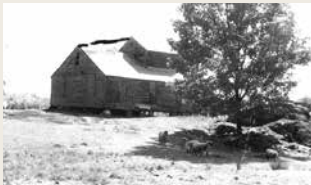
Falmouth's old meeting house.