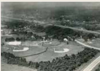
Circa 1968 aerial of the Legion Fields complex.

1956 The Falmouth Playground Association, with land leased from the American Legion, establishes a central area for sports and recreation.