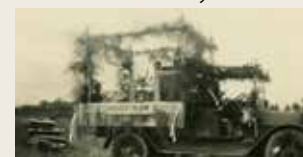
This Old Home Day float from Graves School won First Prize for Education.

1925 The town purchases a Reo Speed Wagon Fire Engine for $3,000. The engine is currently on display at the Falmouth Historical Society.