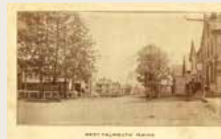
1916 postcard depicting West Falmouth Corners.