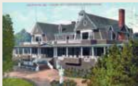
Casino at Underwood Springs Park.

1913 Portland Country Club relocates to Foreside.