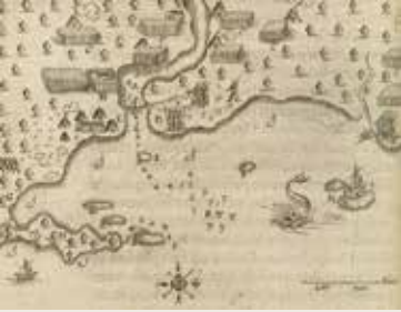
1613 Map of Saco by Samuel de Champlain.

French explorer Samuel de Champlain visits the Maine coast and names its indigenous peoples the "Almouchiquois."