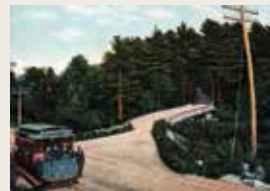
Circa 1910 postcard of the trolley at Underwood Springs.

To promote its line, the Portland and Yarmouth Electric Railway Company opens Underwood Springs Park, featuring a casino, hotel, and outdoor amphitheater.