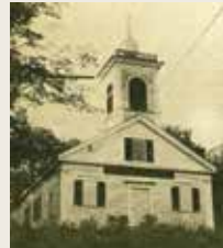
Oak Grove Academy was moved to its current location visible from Middle Road and later became the lodge for a fraternal organization.

Falmouth opens its first high school, Oak Grove Academy.