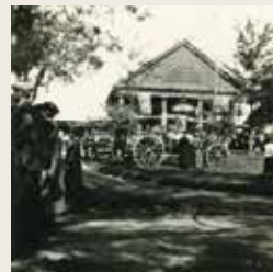
1922 Old Home Day celebration on the grounds of the Falmouth Congregational Church.