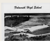
1957 Falmouth High School Dedication Program.

1957 Falmouth builds a new high school on Woodville Road, currently today's middle school.