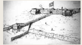
Sketch of Fort New Casco.

Renewed peace leads to the construction of a new fort in today's Falmouth. Fort New Casco is an English center for trade with local Abenaki and a stronghold along England's colonial frontier.