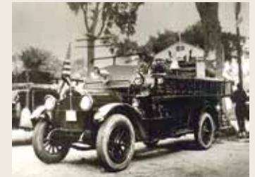
1925 Town REO Speed Wagon Fire Engine.

1925 The town purchases a Reo Speed Wagon Fire Engine for $3,000. The engine is currently on display at the Falmouth Historical Society.