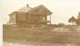
The Iverson home, shown here in 1908, was donated to the Falmouth Memorial Library Association for use as a memorial library.

Falmouth Memorial Library opens in its current location.